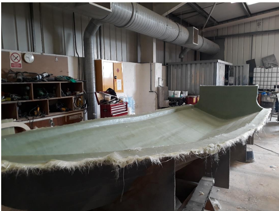
Figure 2 First stages of hull construction