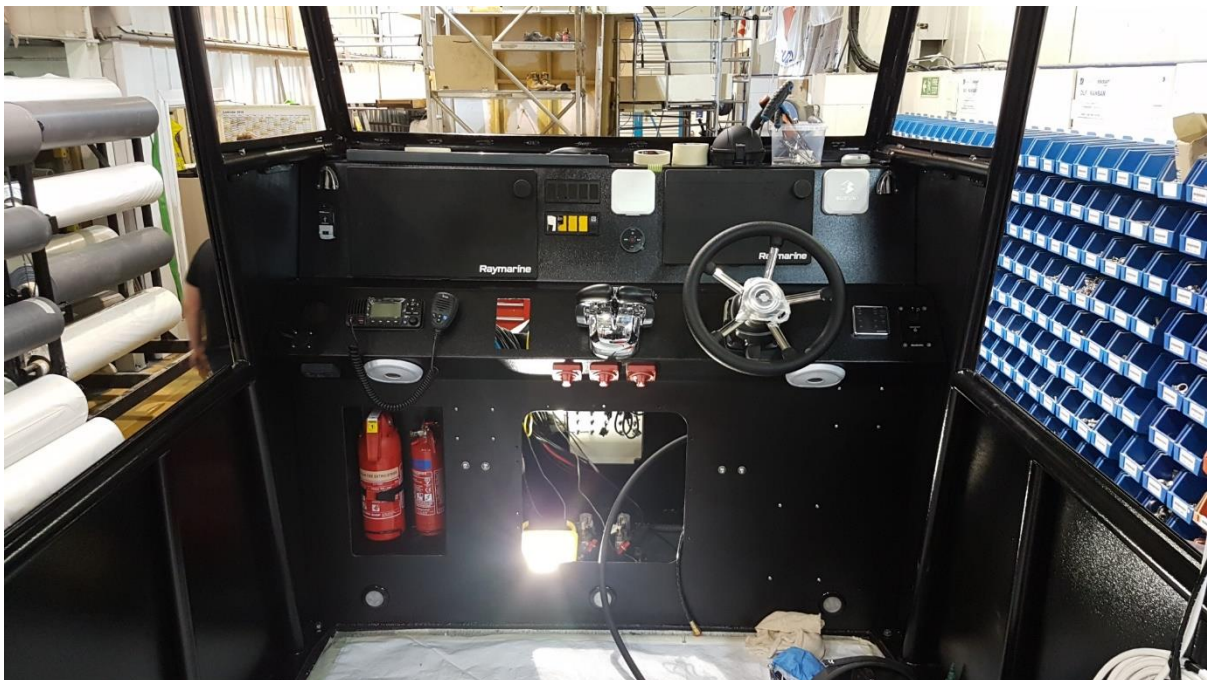
Figure 5 Console and wheelhouse constructed

The wheelhouse has been constructed and the hull, decks and console have been power-coated providing a tough and durable finish. Figure 5 shows the console fitted to the hull. The vessel is now all fitted out inside and the wiring up of the instruments and vessel is on-going. With the hull now complete the next steps in bringing it closer to completion will be the fitting of the tubes.