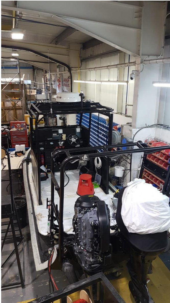
Figure 5 Final stages of build

The expected completion and delivery is between 10 th and 15 th December 2018. The import documentation for the FLIR camera is being dealt with by officers, part of which includes assurances that the FLIR camera will not be installed on a military vessel. Once complete Ribcraft will fit the FLIR to the vessel, before delivery.