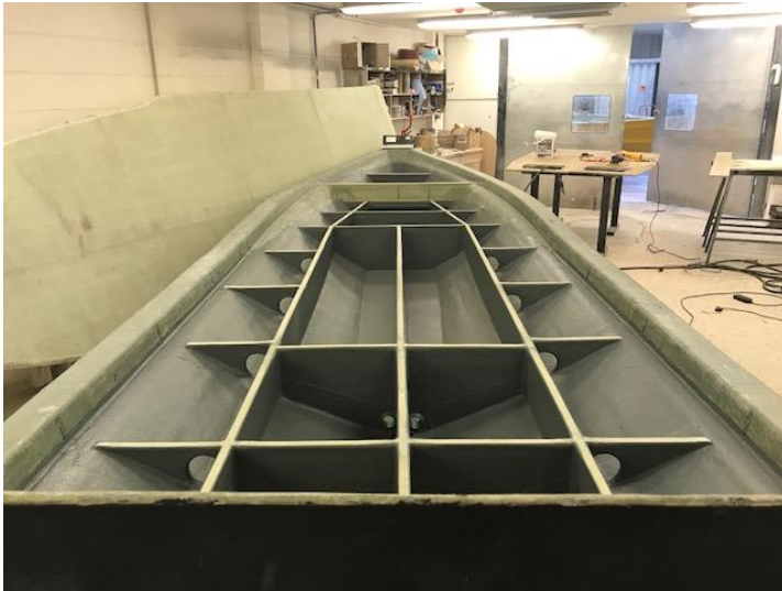
Figure 3 Constructing the Hull