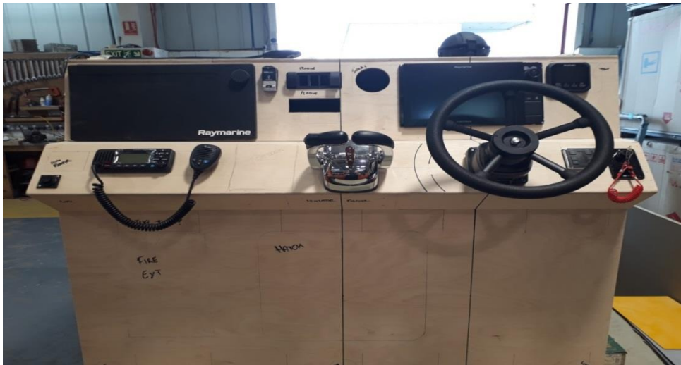
Figure 1 Mock-up of console to allow for any necessary modifications

Since August work on the new fisheries patrol vessel has progressed well. The 7.8m RIB is nearly at the construction completion stage. Throughout the construction process officers have visited the factory providing input into any specification queries and ensuring speedy resolutions to any questions from the builders. Officers have inputted into the layout of the console and location of equipment and instruments.