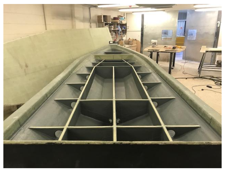
Figure 3 Constructing the Hull