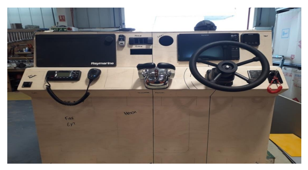
Figure 1 Mock-up of console to allow for any necessary modifications

Since August work on the new fisheries patrol vessel has progressed well. The 7.8m RIB is nearly at the construction completion stage. Throughout the construction process officers have visited the factory providing input into any specification queries and ensuring speedy resolutions to any questions from the builders. Officers have inputted into the layout of the console and location of equipment and instruments.