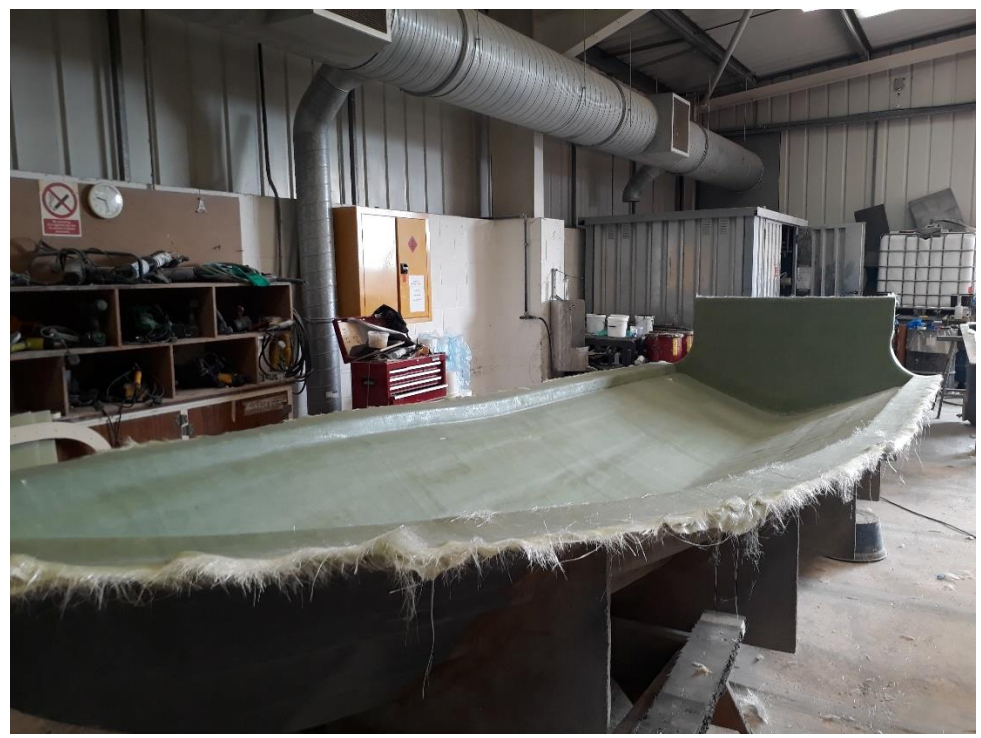
Figure 2 First stages of hull construction