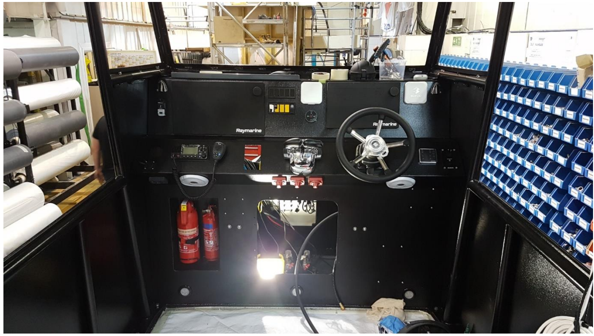
Figure 5 Console and wheelhouse constructed

The wheelhouse has been constructed and the hull, decks and console have been powercoated providing a tough and durable finish. Figure 5 shows the console fitted to the hull. The vessel is now all fitted out inside and the wiring up of the instruments and vessel is on-going. With the hull now complete the next steps in bringing it closer to completion will be the fitting of the tubes.