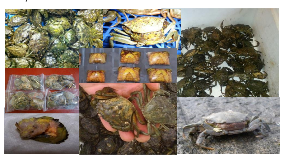
Figure 2: Shore crabs - some moulting and packaged for sale

Areas of crab tiles are worked part-time by fishers at spring low tides. Crab tilers are solitary and on the shore for approximately 90 minutes. Usually a patch of tiles is solely worked by one individual who owns those tiles. Crab tilers usually work their tiles on a recreational basis to collect bait for angling or on some estuaries this activity is more commercial, and crabs are sold as bait to shops and on-line. Crab tilers usually only collect crabs which are over 40mm carapace width, not berried females and in the stage of pre-ecdysis (moulting stage) (Sheehan et al. 2008). Moulting crabs represent 10% of the crabs found under crab tiles (Sheehan et al. 2008).