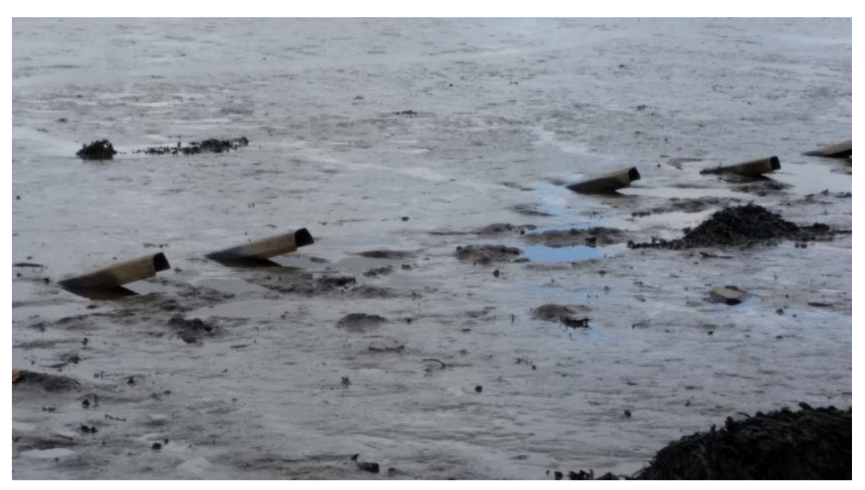
Figure 1: Crab tiles on the Exe Estuary

Crab Tiles are artificial shelters such as roof tiles, guttering, drainpipes, chimney pots and tyres.