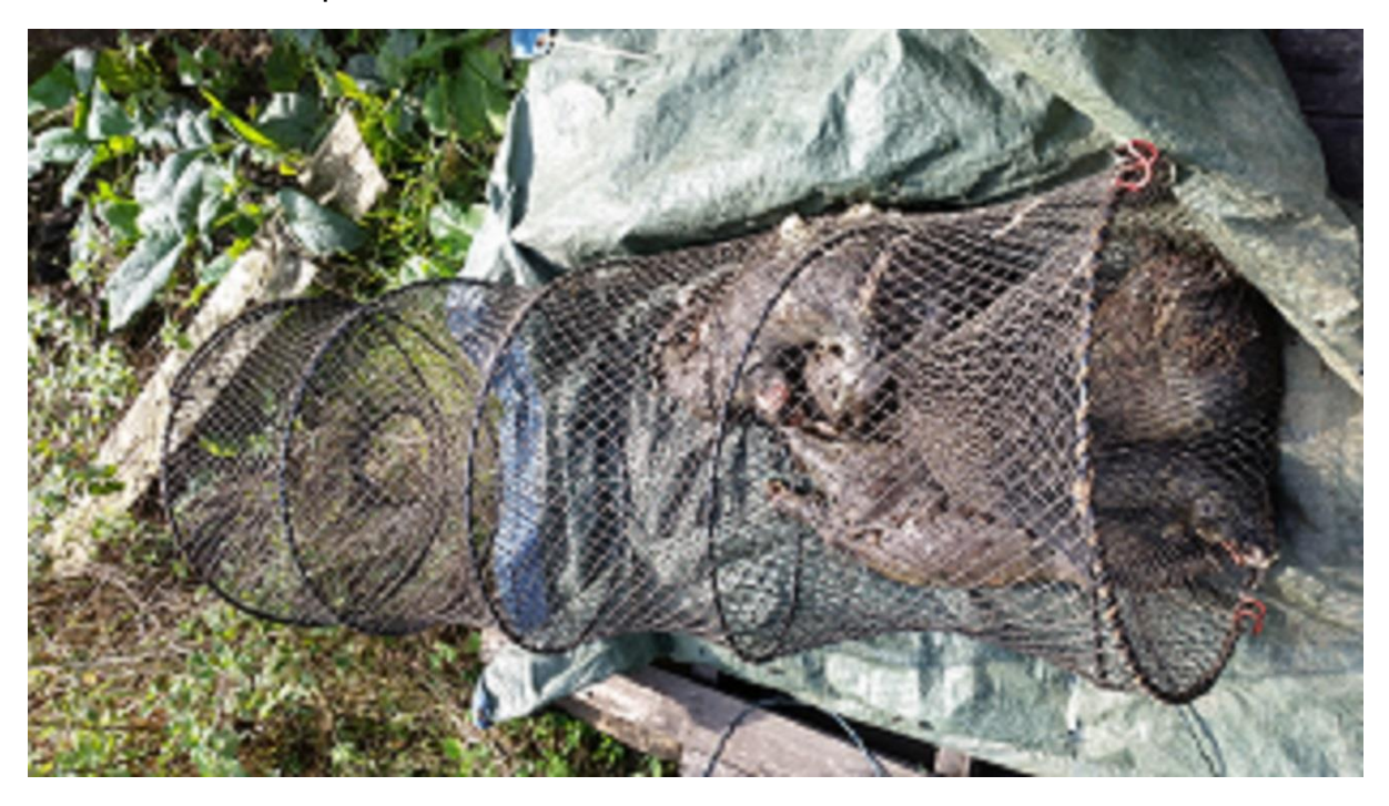
Photograph 6: Three dead otters found in this larger illegal fixed trap. Mother and two cubs.

The evidence above is likely to be a sub-set of the number actually drowned in fish and crustacean traps.