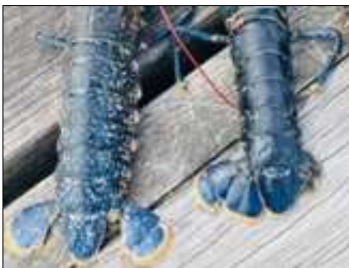
Image above: Mutilated lobster tails – tail flaps missing.

A "mutilated lobster" means a lobster ( Homarus gammarus ) or spiny lobster ( Palinurus elephas ) where any of the five flaps of the tail fan is missing or mutilated in such a manner that could hide or obliterate a V-notch.