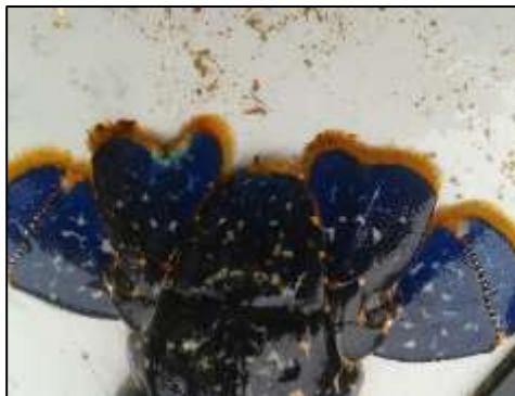
Image above: 'V' - notch reducing from moulting.