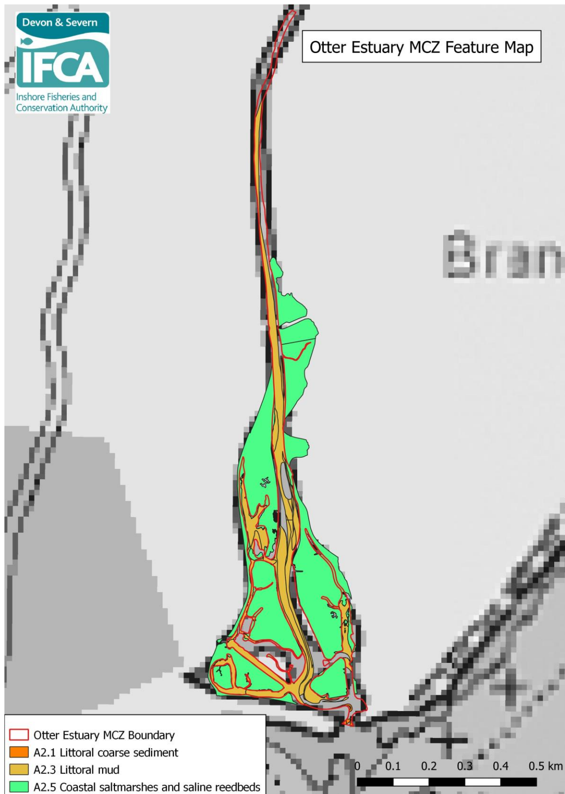
Figure 2: Extent of features, intertidal coarse, intertidal mud, and coastal saltmarshes and saline reedbeds) designated in the Otter Estuary MCZ