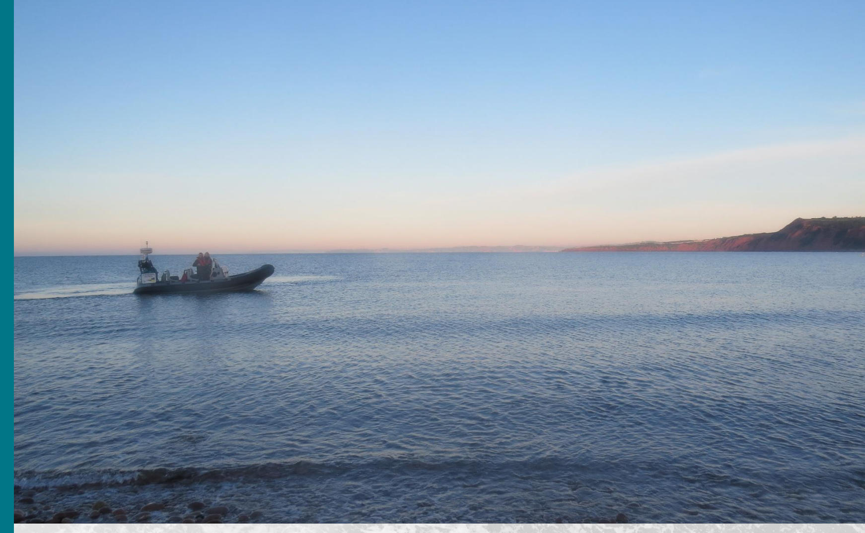
Eleven Month Progress Report Relating to the Annual Plan - FY 2023/2024